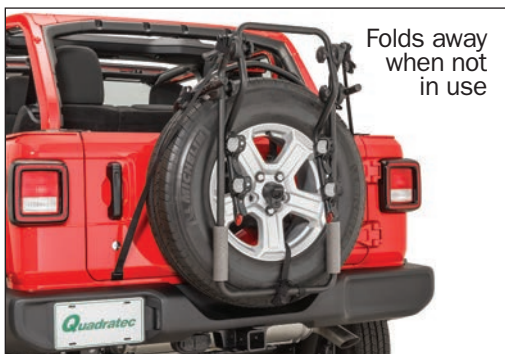
Folds away when not in use