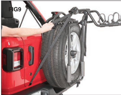
Attach the tailgate retaining straps to the bottom of the tailgate on both sides and tighten the buckles. (FIG9)