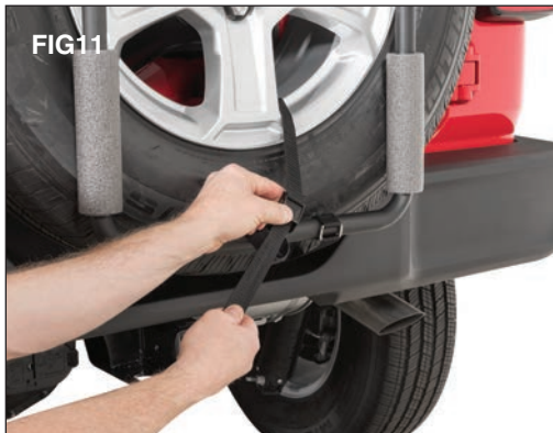
Using the provided loose retaining strap, (with eyelet) (G) loop the strap around the bottom crossbar of the rack and through the wheel and secure it to the buckle at the bottom of the rack. (FIG11)