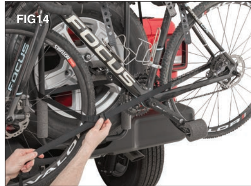
Install the supplied foam pedal protectors (E) if desired. Thread the provided safety strap (H) around the back of the vertical tubes of the rack and continue to thread the strap through both wheels and secure it using the buckle. (FIG14)