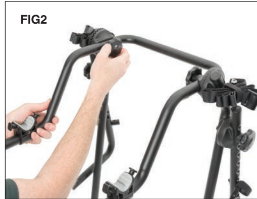
Gently tighten knobs and ensure the teeth on the hinges engage evenly. (FIG2)