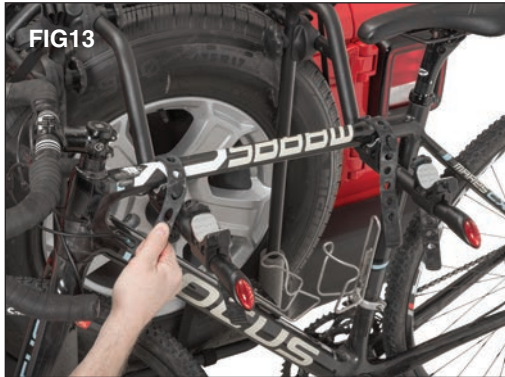
Place the bike in the cradles as shown. Pull the rubber retaining straps over the frame of the bike and secure it on the rectangular hook. (FIG13)