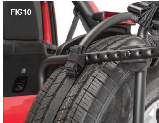
Excess strap can be stowed using the attached hook and loop retainers. (FIG10)