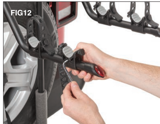
Adjust the angle of the bike rack arm if needed. The arm should be angled up slightly. Position the Bike cradles as needed for your bike and snug the Allen bolts with a 5mm hex wrench. Final adjustment of the bike cradles can be made later when bikes are installed. (FIG12)