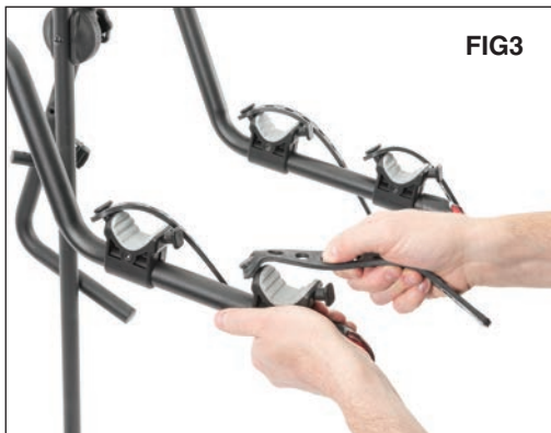
Install the round end of the rubber retaining straps by pulling them over the square retaining tabs on the cradles. (FIG3)