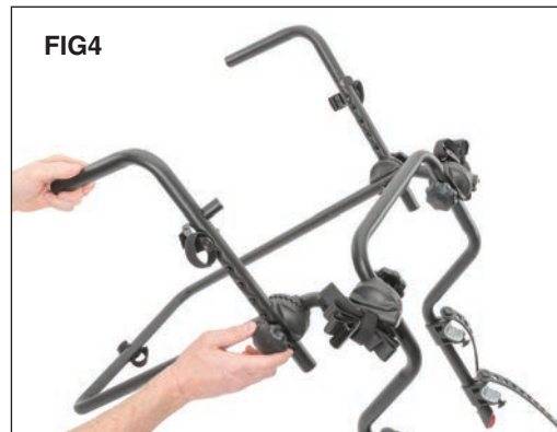
Loosen the lower knobs and rotate the retaining arms evenly. (FIG4)