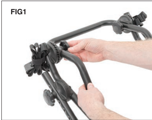
Put on safety glasses. Loosen upper knobs and unfold the bike rack arm to approximately 90 degrees. (FIG1)