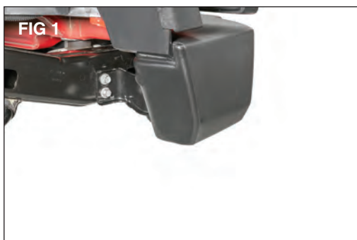
Put on safety glasses. Remove the rear wheel & tire per vehicle's owners manual to gain rear bumper access. (FIG 1).