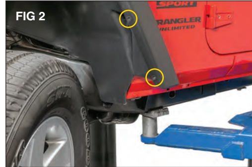
Using diagonal cutting pliers remove the two plastic rivets from the fender flare shown (FIG 2).