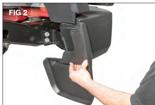
Line up the splash guard to rear bumper as shown. Take care to line up the edge of splash guard with the edge of the rear bumper. (FIG 2).