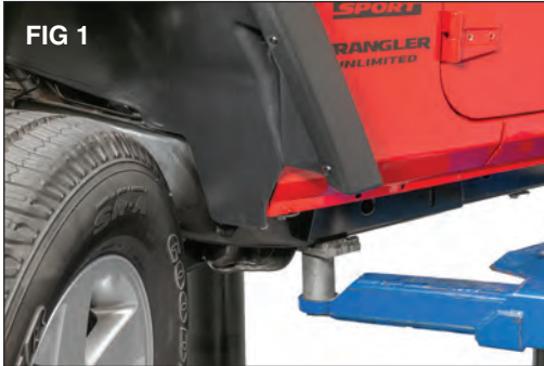
Put on safety glasses. Start the vehicle and turn the wheel to gain access to inner wheel liner. (FIG 1).