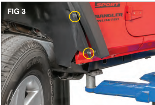
Install the supplied U Nuts on to inner wheel liner in the locations from the two previously removed plastic rivets. (FIG 3).