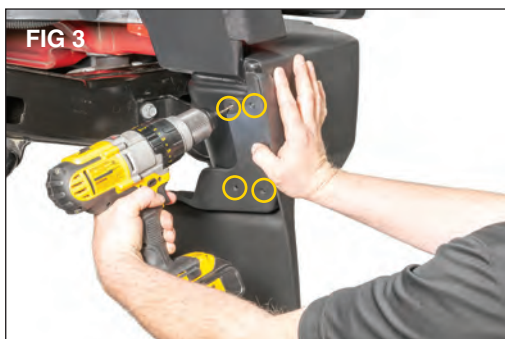
While holding the splash guard in place on the bumper drill 4 holes through the splash guard into the bumper using a drill and 3/32" drill bit. (FIG 3).