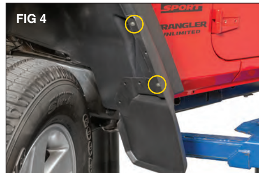
Mount the splash guard to fender flare using two screws into the U nuts. (FIG 4).