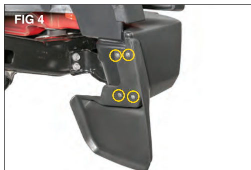
Install the 4 screws into the 3/32" holes (FIG4). Do not over tighten.