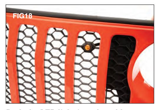
Push the LED light into the rubber grommet to seat the light into the mounting bracket. (FIG 18)

Repeat on the other two grille slots and secure the harness appropriately with the provided cable ties.