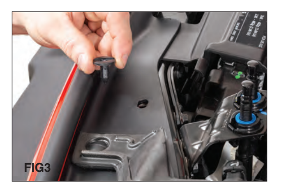
Pry up the plastic fasteners (6 total) using a small flat blade screwdriver. First remove the center, then remove the body of each plastic retainer (FIG 3). Set rivets aside in a safe place for re-installing the grille.