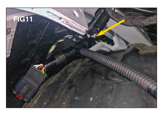
the OEM harness until you hear a click and then push the red and gray locking tabs to lock the connections. (FIG 11)