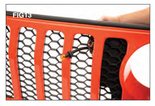
front camera you will need to lower the light in the center slot and the other two to match if desired. Next, carefully separate the rubber grommet from the light and fish them through each hole in the grill to be used. (FIG 13)