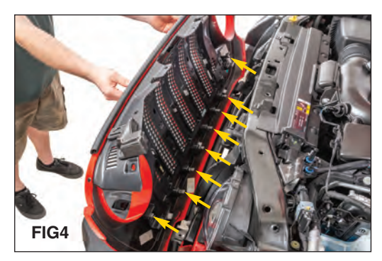
Gently tilt the grille forward and then gently pop the lower portion of grille from its (8) retaining clips. (FIG 4).