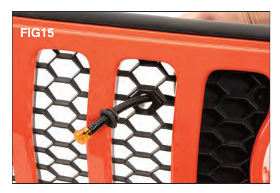
together at the slot and that will allow them to clip in. Push mount in and flush until it clicks. (FIG 15)