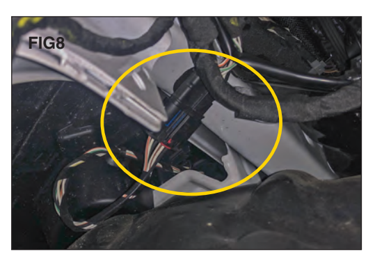
Locate the drivers side fender flare lamp harness connector by looking from underneath the wheel well. (FIG 8)