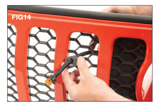
Slide the light mounts over the wire loom as shown. (FIG 14) Snap each diamond-shaped light mount into the the correct grill. Squeeze the bottom