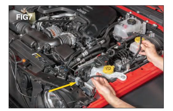
Route the harness behind the headlight and past the reservoir bottle towards the firewall on the divers side.