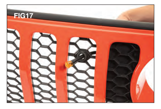
Slide the rubber grommet down the loom and push it into the light mount. (FIG 17)