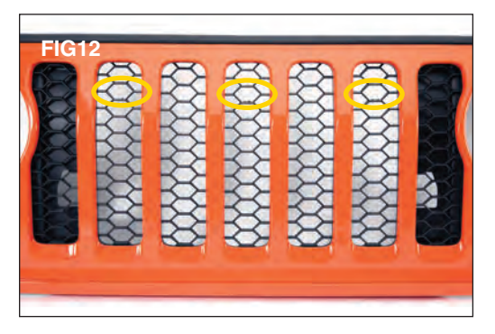
With the wiring now routed towards the grill, Locate the 2nd, 4th and 6th slots in the grill as shown (FIG 12) Then locate the 2nd from the top complete diamond shape, this is where to place the lights. Note: On models with the