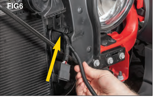
Fish it through the rubber barrier on the driver side of the radiator as shown.