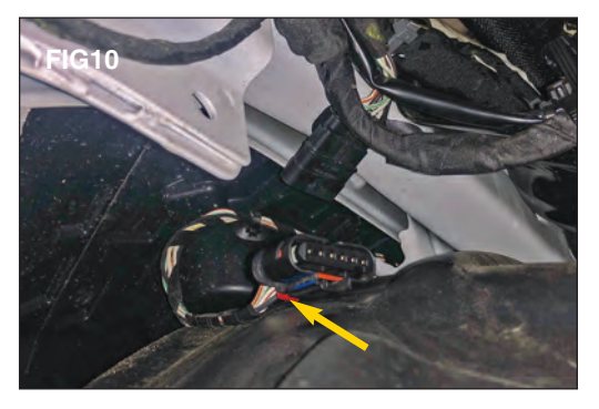
Slide the red locking tab backwards and disconnect the plug. (FIG 2) Then, plug in the new Tee harness to each side of