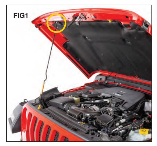
Put on safety glasses. Open the hood of your Jeep<sup>®</sup>. Put the prop rod into the correct slot to hold hood open (FIG 1).