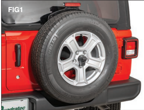
Remove the spare tire per your vehicle's owners manual. (FIG 1)