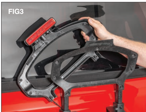
Separate the housing to expose the wiring harness and unplug the factory connector from the back of the brake light. (FIG 3) Set the 3rd brake light aside.