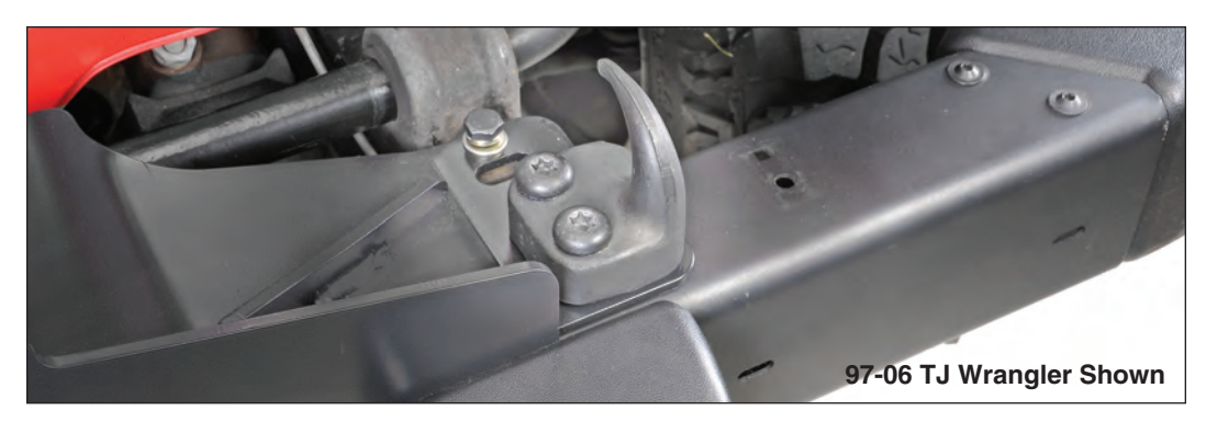
For both models: If your vehicle was equipped with factory tow hooks you can reinstall the hooks using the factory