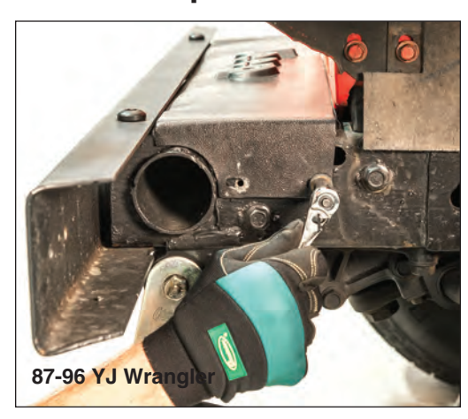
Put on safety glasses. Remove frame / sway bar cover by removing the 2 bolts on either side with a 3/8" socket.