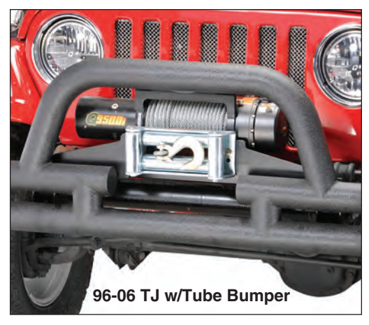
NOTE For both models: The supplied fairlead nuts & bolts are included as a courtesy for mounting a winch fairlead to the raised mounting plate.