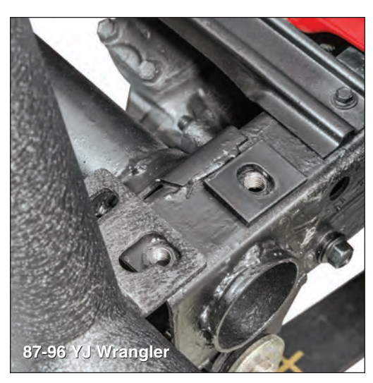
If you are installing the winch plate on a YJ Wrangler with a Tube style bumper place the supplied spacer plates over the 2nd mounting holes in your frame as shown above. Repeat for other side.