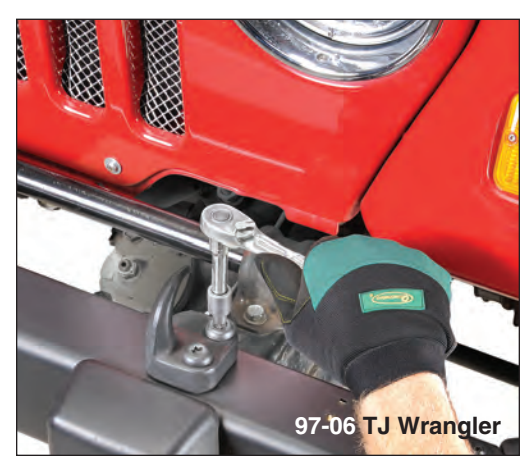
If your vehicle is equipped with Tow hooks retain the bolts and tow hooks for reassembly.