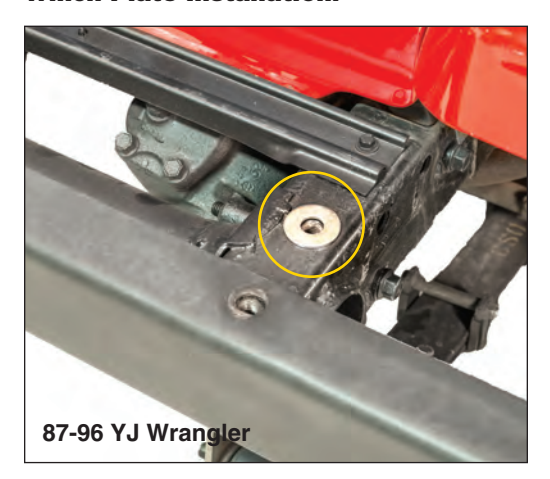
When installing winch plate on a YJ with a stock bumper place a supplied ½" washer over second bumper hole.