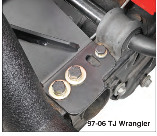
For either a stock or tubular bumper: For TJ, Position winch plate so that it is aligned over the 3 mounting holes per side. Install the supplied 10mm x 50mm sway bar bolts with a lock washer & flat washer using a 16mm socket. Then install supplied 1/2" bolts with a lock washer & flat washer using a ¾" socket, as shown above.