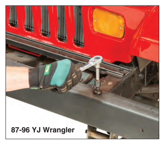
Remove the upper bumper bolts using a T55 Torx bit. (2 on YJ / 4 on TJ) Do not remove the lower bumper bolts.