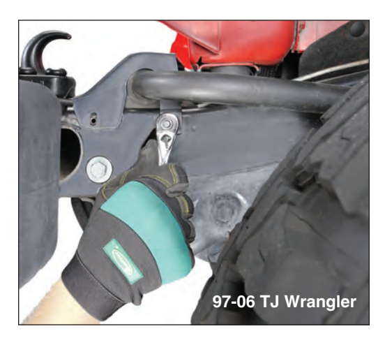
Note: The Original Equipment frame cover will not be used with the Raised Winch plate.