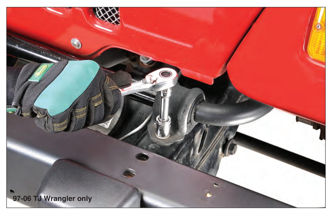
For 97-06 TJ Wrangler only: Remove the 2 front sway bar retaining bolts with a 15mm socket. Do not remove the rear swaybar mounting bolts.