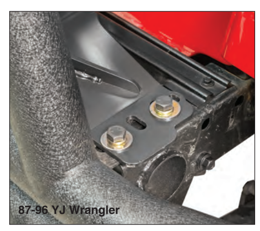
For either a stock or tubular bumper: for YJ, align the winch plate over the two correct holes, install the supplied 1/2" bolts with a lock washer and a flat washer and tighten using a ¾" socket.