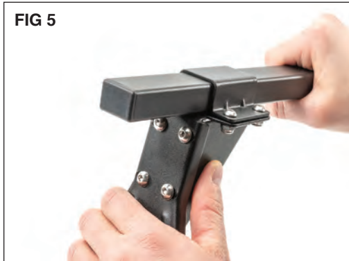
Slide the cross bar through the upright and retaining strap. Repeat on opposite end. (FIG5)