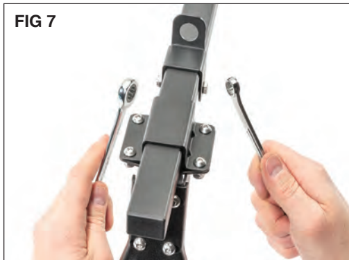
Tighten in the desired position with (2) 10mm wrenches. (FIG7)