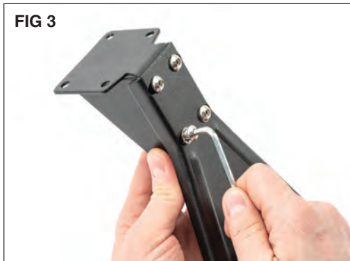
Attach the pedestal to the upright with 4 button head screws and 4 star washers with a 4mm hex key. The pedestal height is adjustable, make sure to mount all 4 at the same height. (FIG 3)