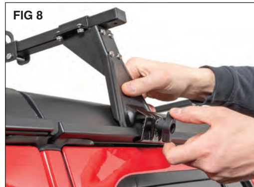
Place the rack on top of the vehicle and position the uprights into the drip rail on either side of the vehicle.

Take care to place them in the same position on both sides. Snug the clamp against the outside of the drip rail with the hand knob. Position second rack and repeat installation. At this point even the spacing of the crossbar in the uprights and fully tighten the retaining strap bolts with a 4mm hex key and 10mm wrench.