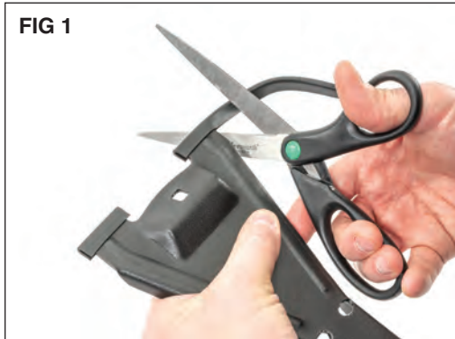
Put on safety glasses. Locate the 4 rack uprights and the rubber chafe strip. Use scissors to cut the chafe strip into pieces and fit them on the feet of the upright. (FIG1)