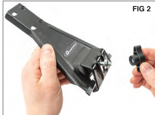
Loosely attach the vinyl coated clamp to the upright with a carriage bolt, flat washer, lock washer and hand knob. (FIG2)