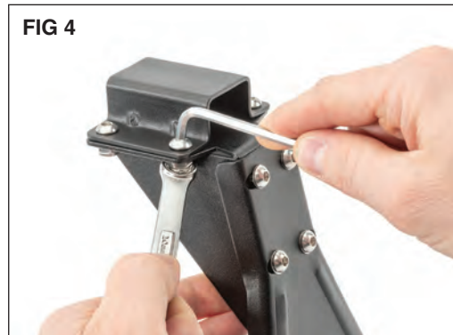
Using a 4mm hex key and a 10mm wrench loosely bolt the retaining straps to the pedestal with 4 button head screws and 4 nylocks. (FIG4)